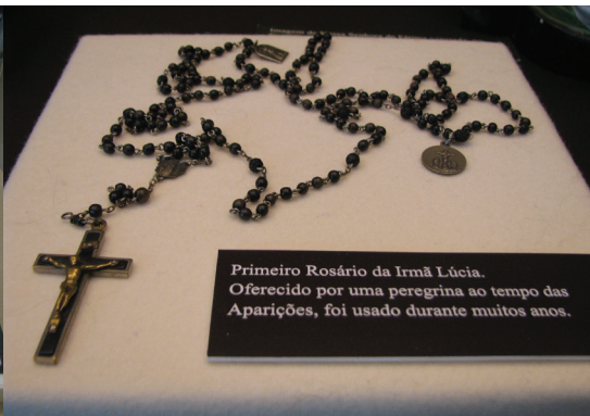
Primeiro Rosário da Irmã Lúcia. Oferecido por uma peregrina ao tempo das Aparições, foi usado durante muitos anos.

The year 2017 will have a greater emphasis on three items that were used at the time of the Apparitions: The first Rosary that was offered to Lúcia, the Rope that she used around her waist together with her cousins Jacinta and Francisco and the Scarf that Lúcia wore on her head during the Apparitions of Our Lady.