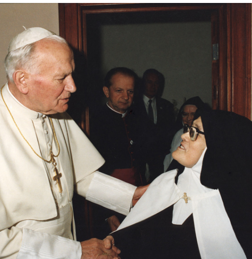
Pope John Paul II with Sister Lucy in Fatima on May 13, 1982.

Next February 13th completes 13 years ago that Our Lady had fulfilled her promise to come to take Lúcia to God. Less than 2 months later on April 2nd, she came also to seek John Paul II, the “Representative of Christ on Earth”, as Sister Lúcia liked to call the Holy Father.