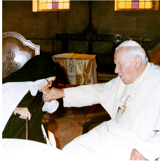
Pope John Paul II with Sister Lucy in Fátima on May 13, 2000.

The visit of the Virgin Mary that little Lúcia received in Fátima, along with her cousins Francisco and Jacinta in 1917, she went to the top of a natural mission to which she remained faithful until the end of her days. Sister Lúcia leaves us with an example of great fidelity to the Lord and of joyful adherence to His divine will. I remember with emotion the various meetings that I had with her and the bond of spiritual friendship that over time had become more intense. I have always felt supported by the daily gift of her prayer, especially in the hard times of trial and suffering. May the Lord reward her amply for the great and hidden service to the Church. I like to think that Sister Lúcia