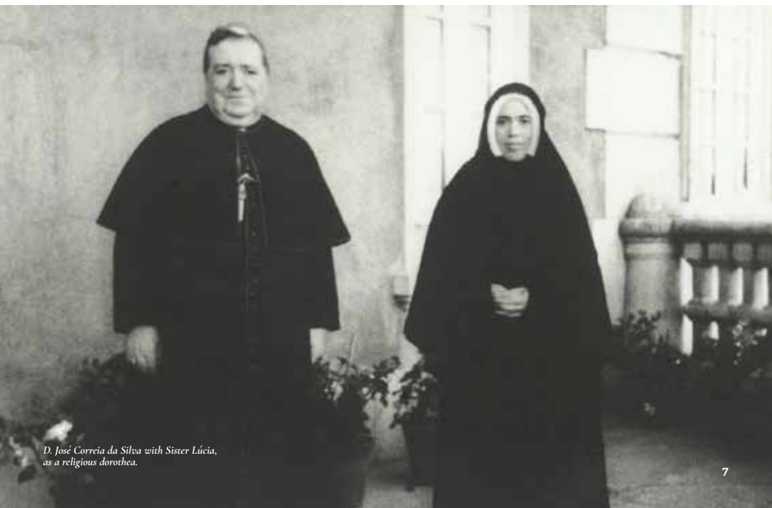
D. José Correia da Silva with Sister Lúcia, as a religious dorothea.