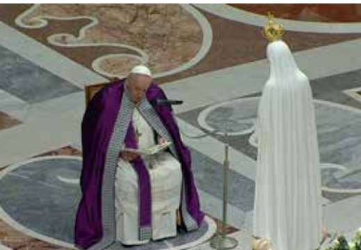
Pope Francis during the act of consecration of Russia, Ukraine and the World to the Immaculate Heart of Mary, Vatican, 25th of March 2022.

Sister Lúcia personally confirmed that this solemn and universal act of consecration corresponded to what Our Lady requested: «Yes, it was done as Our Lady requested, and was accepted by Heaven, since the 25th of March 1984» (letter of 8th of November 1989) (Memórias da Irmã Lúcia I, Apêndice III, 10ª Ed., 2005, p. 202).