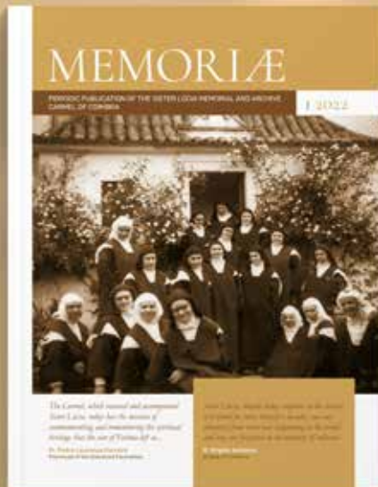
Memoriae I | 2022 Translated into English